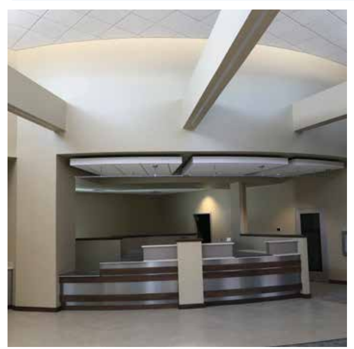
A peak inside of Security First's new building in Cozad