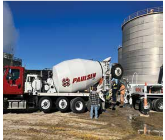
Flowable fill pour at Trenton Ethanol Plant

Lets all work together to have a safe and prosperous 2024 construction season!!