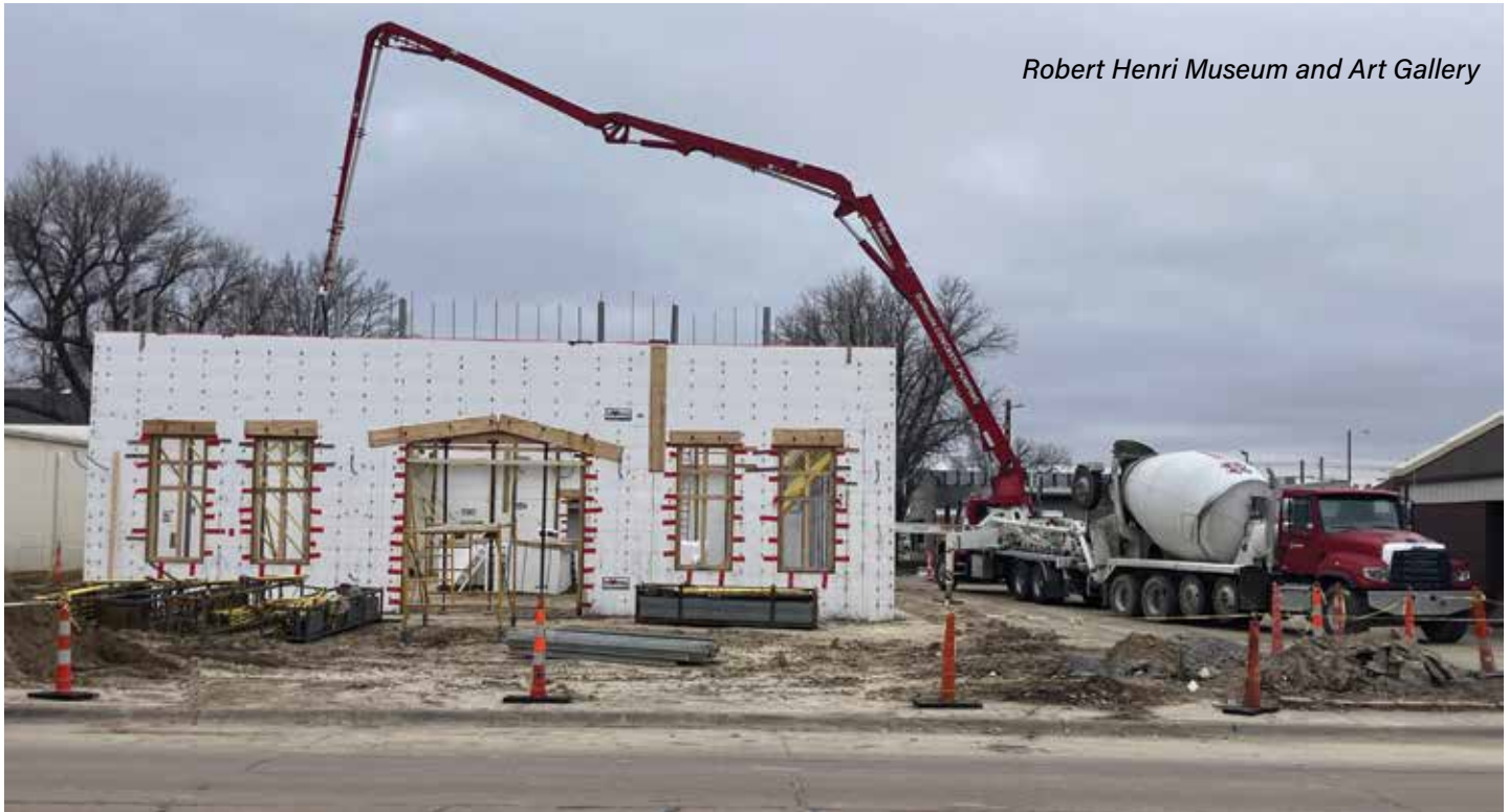
Robert Henri Museum and Art Gallery

The Building Department has a full slate for the 2024 construction season. The battle will be in full swing this summer, completing extensive remodels to both Cozad Schools, while keeping all the other jobs moving forward.