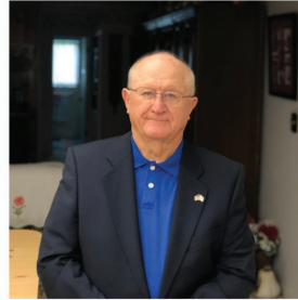
Jerry Bruckheimer Treasurer