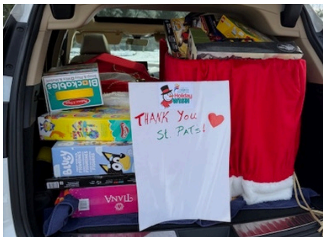
FCCS Holiday Wish Program