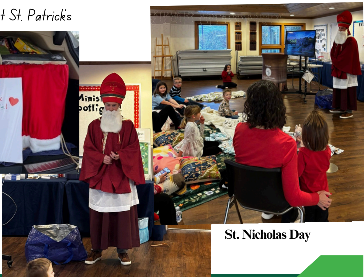
St. Nicholas Day