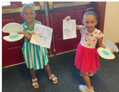
The Parable of the Hidden Treasure