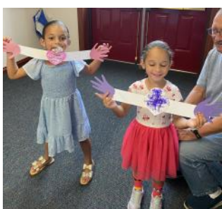
The Parable of the Unforgiving Servant

Over the summer, the children learned about the Armor of God and some of the parables. Enjoy the pictures below of some of their activities to help them understand these lessons.