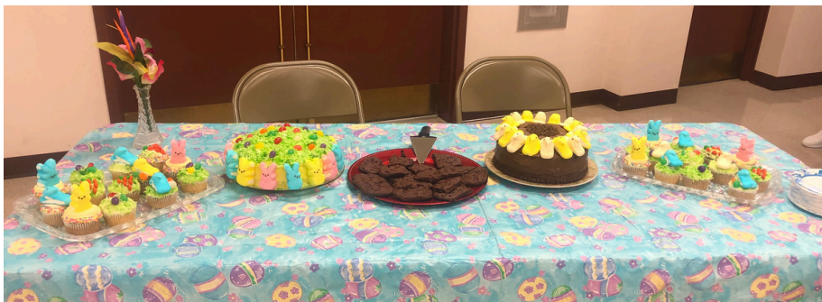
Colleen Brown's amazing dessert selections

The meal on May 7 will be Shepherd's Pie, back by request! We are always looking for help and people to sit and mingle with guests. I recently received feedback from 2 guests who appreciated a listening ear! We serve from 4:30-6:30 but can always use volunteers to prepare and serve. Contact Lynn Klumpp (610-761-2606), if you are able to assist.