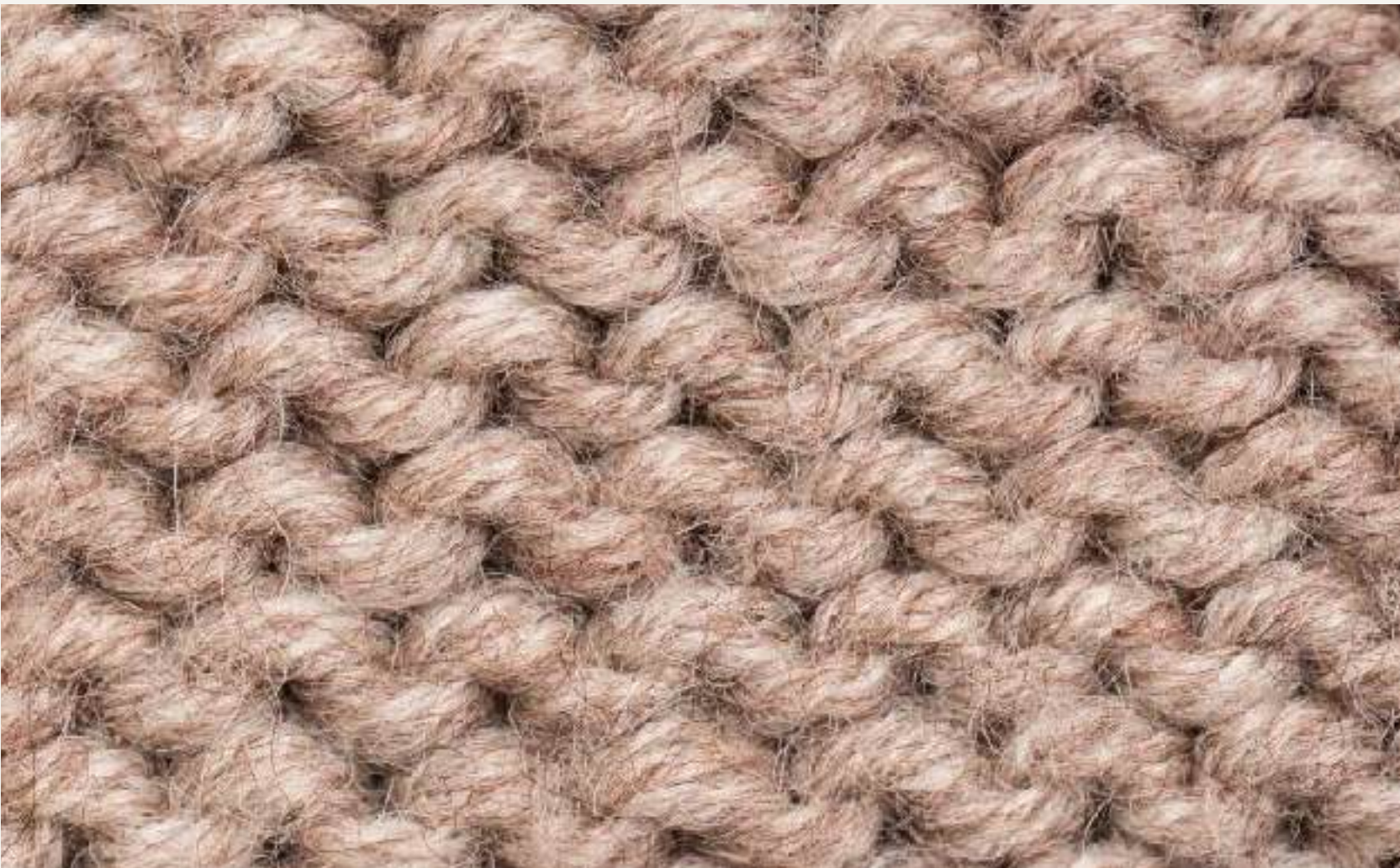
Wool Sisal Carpet