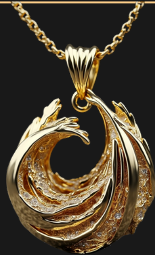
"Crystal Flow" pendant