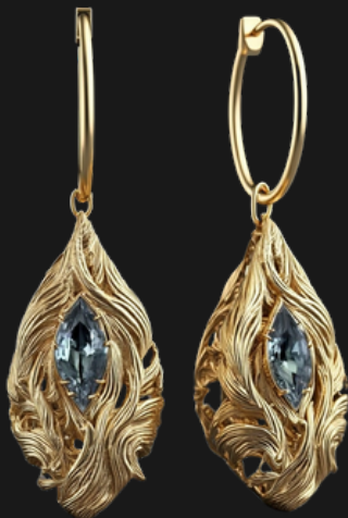
"Crystal Flow" Earrings