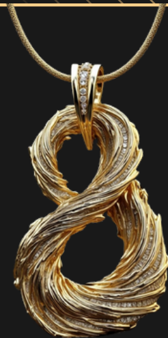
"Infinity wave" pendant