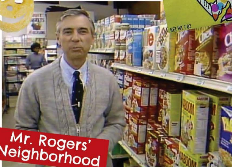
Mr. Rogers' Neighborhood