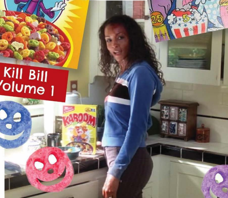
Kill Bill Volume 1