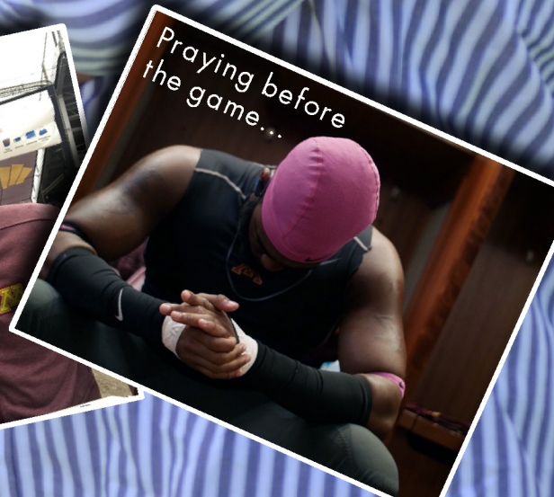
Praying before the game...