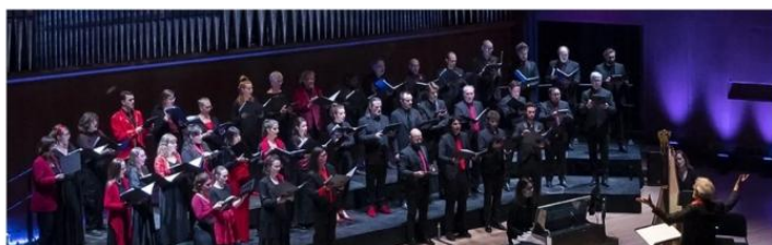
Ensemble ArtChoral Choir