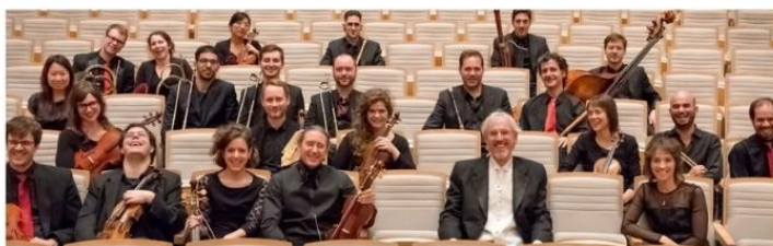
Ensemble Caprice Orchestra