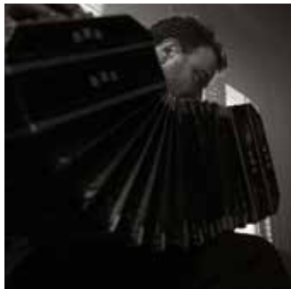
Stéphane Tétrault Cello