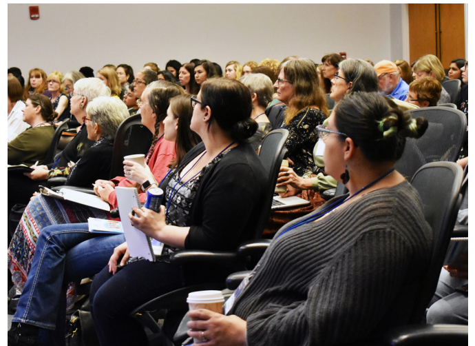
The first MMWSS in 2018 saw a sold-out crowd of women and men from all walks of the STEM fields.

The Symposium is designed to be a hands-on experience in which all attendees are actively participating and problem-solving. Attendees will include women and men of all backgrounds and interests, all levels of education and experience. The Symposium will be held at a location that fosters interaction in a pleasant environment with exceptional operational support at the Babson Executive Conference Center in Wellesley, MA.