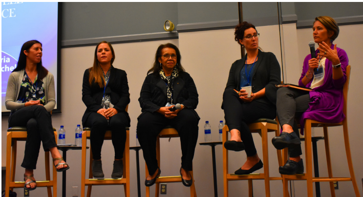
Panel discussion on recruiting women and girls into STEM.

The Nantucket Maria Mitchell Association (MMA) and its partners will bring together women involved in STEM for an engaging meeting that will connect women in all disciplines. Both students and professionals will be encouraged to attend. The Symposium will feature keynote speakers and a series of lectures, round tables, and salon-style group discussions.