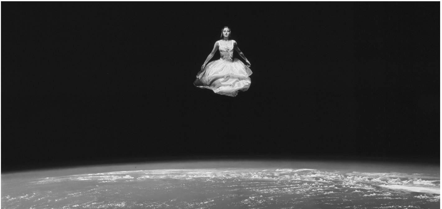
'Musterion' by Kees Bruin