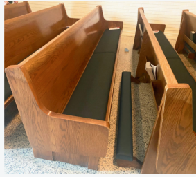
The church has new kneelers and cushions.

The large-scale project cost the parish $118,000. To extend the life of the kneelers, please take care of the kneelers and don't allow your children to stand on them.