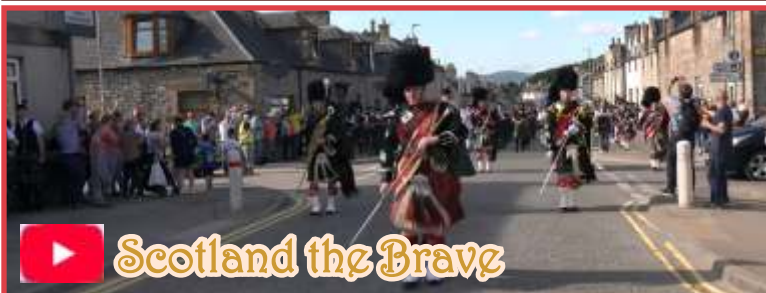
Scotland the Brave

I'll tell you all about it when I'm back both in the June 12th edition of the Wee VOICE , or at the June 12th gathering at Friday Coffee Drop By.