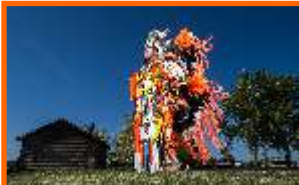
“First Nations Heritage Park, Calgary AB” photo