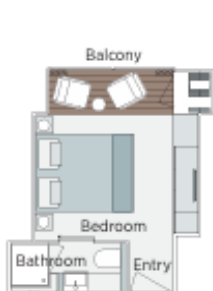
Emerald Panorama Balcony Suite 180ft² (16.7m²) CAT A CAT B CAT C