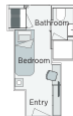
Emerald Single Stateroom 117ft² (10.9m²) CAT ES