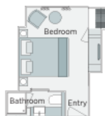
Emerald Stateroom 162ft² (15m²) CAT D CAT E