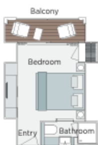
Grand Balcony Suite 210ft² (19.5m²) CAT S