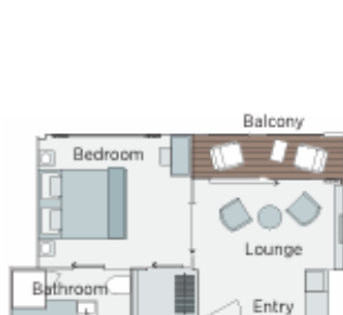
Owner's One-Bedroom Suite 315ft² (29.3m²) CAT SA