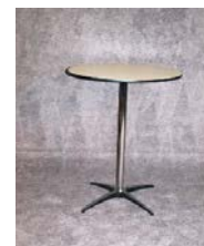
High-top Cruiser table 42" high