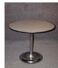
Pedestal table 30" high