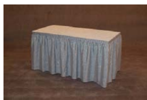
4' Skirted table (silver shown)