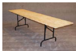
Undecorated table (8' shown)