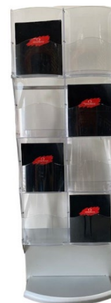
Literature Stand double