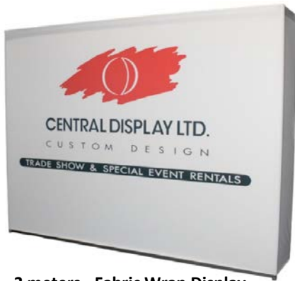
3 meters - Fabric Wrap Display TV options available exhibitor keeps fabric graphics