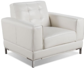
White Leather Chair