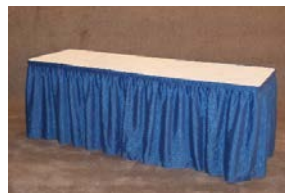
6' Skirted table (blue shown)