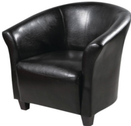
Leather Tub Chair