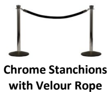
Chrome Stanchions with Velour Rope