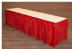
8' Skirted table (red shown)