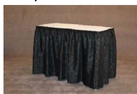
40" high Skirted table (black only)