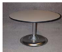
Round Coffee Table 18" high