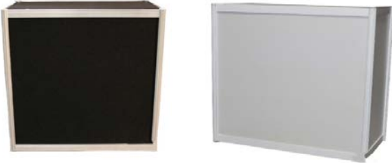
Counters – black or white