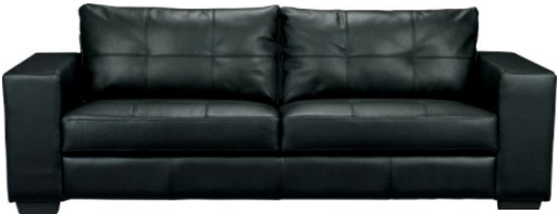
Black Leather Couch