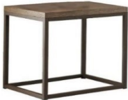
Wood/Metal End Table