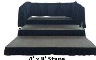
4' x 8' Stage shown - 20", 30" & 40" high