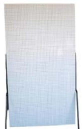
Peg Board - Vertical