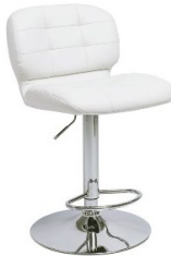
White Adjustable Stool