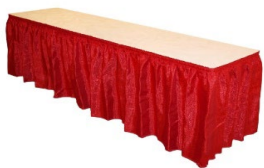
8' Skirted table (red shown)