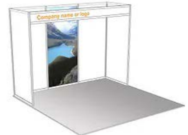
Octanorm - 3 meters shown - Model 100 (signage optional) also available in 6 meters