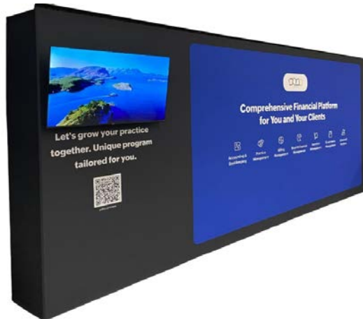
6 meters - Fabric Wrap Display TV options available - as shown exhibitor keeps fabric graphics