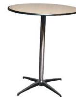
High-top Cruiser table 42" high