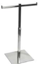
Double sided Bag Rack 50 1/2" up to 71 1/4" high