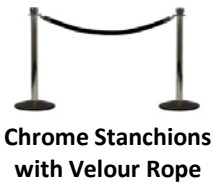
Chrome Stanchions with Velour Rope