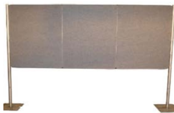
Velcro Poster Board (grey & black side) 4' x 9'