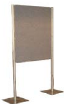
Velcro Poster Board (grey & black side) 4' x 3'