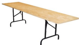
Unskirted table (8' shown)