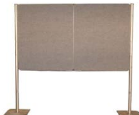
Velcro Poster Board (grey & black side) 4' x 6'