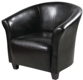
Leather Tub Chair