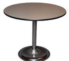
Pedestal table 30" high