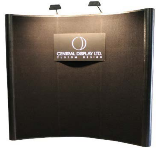
Pop-up Display - 10' wide x 8' tall