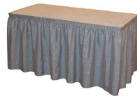
4' Skirted table (silver shown)