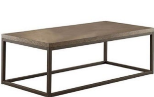
Wood/Metal Coffee Table