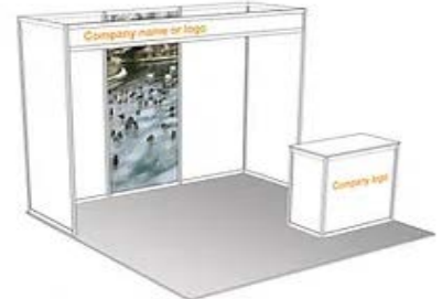
Octanorm - 3 meters with Counter shown - Model 101 (signage optional) also available in 6 meters