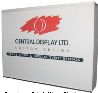
3 meters - Fabric Wrap Display TV options available exhibitor keeps fabric graphics