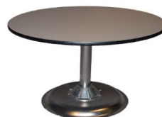
Round Coffee Table 18" high