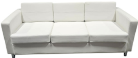
White Leather Couch