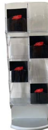
Literature Stand double