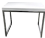
White End Table