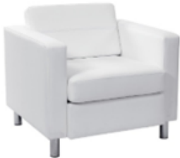
White Leather Chair