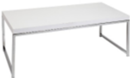
White Coffee Table