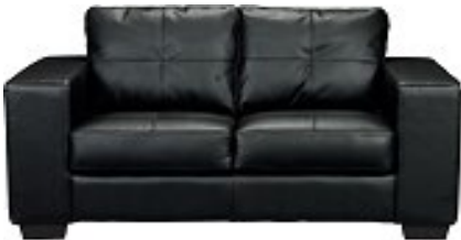
Black Leather Loveseat