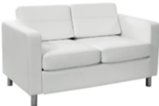
White Leather Loveseat