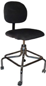
Stools - Highback Manual