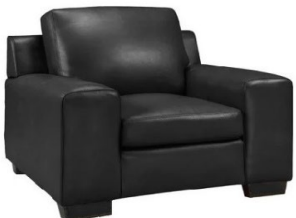
Black Leather Armchair