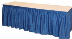
6' Skirted table (blue shown)