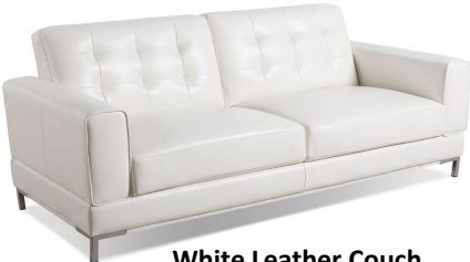
White Leather Couch