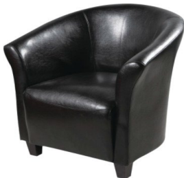
Leather Tub Chair