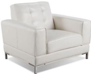
White Leather Chair