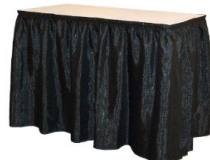
40" high Skirted table (black only)