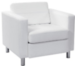
White Leather Chair