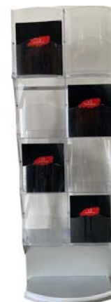
Literature Stand double