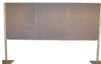
Velcro Poster Board (grey & black side) 4' x 9'