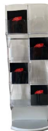
Literature Stand double