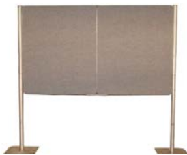
Velcro Poster Board (grey & black side) 4' x 6'