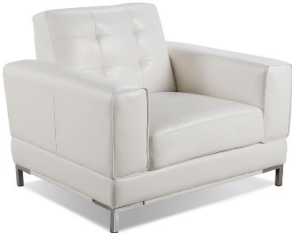
White Leather Chair