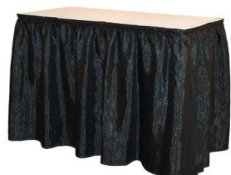
40" high Skirted table