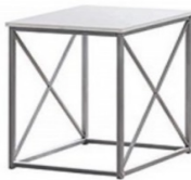
White End Table