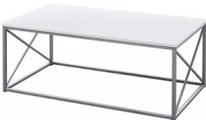
White Coffee Table