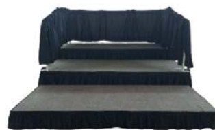
4' x 8' Stage shown - 20", 30" & 40" high