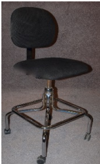
Stools - Highback Manual