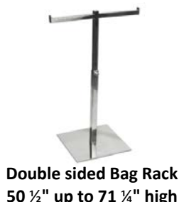
Double sided Bag Rack 50 1/2" up to 71 1/4" high