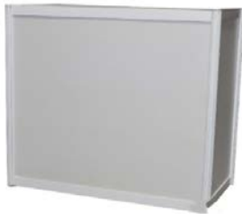
Counters – black or white