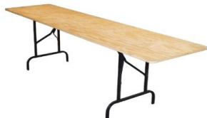
Unskirted table (8' shown)