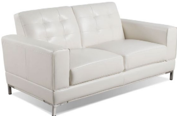
White Leather Loveseat