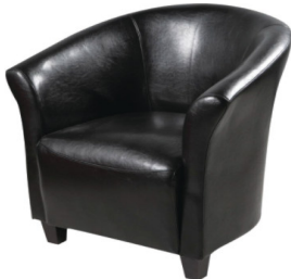
Leather Tub Chair