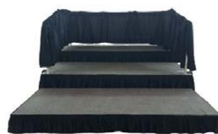
4' x 8' Stage shown - 20", 30" & 40" high