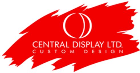
EXHIBIT INSTALLATION SERVICES