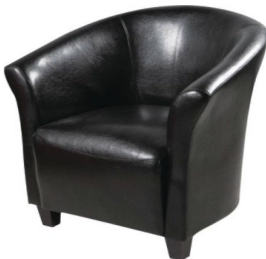
Leather Tub Chair