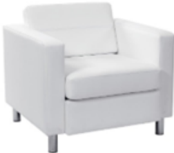
White Leather Chair