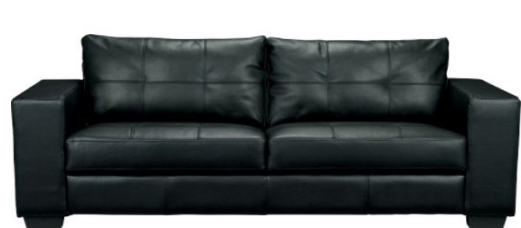
Black Leather Couch