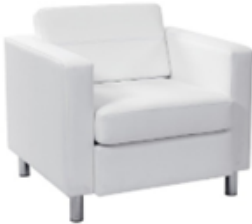
White Leather Chair