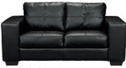
Black Leather Loveseat