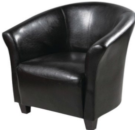
Leather Tub Chair