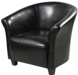
Leather Tub Chair