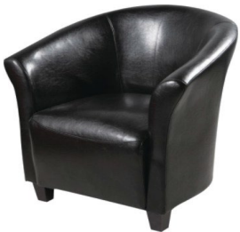
Leather Tub Chair