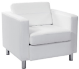
White Leather Chair