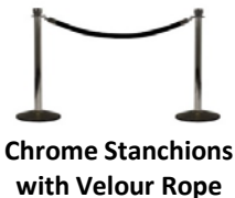
Chrome Stanchions with Velour Rope