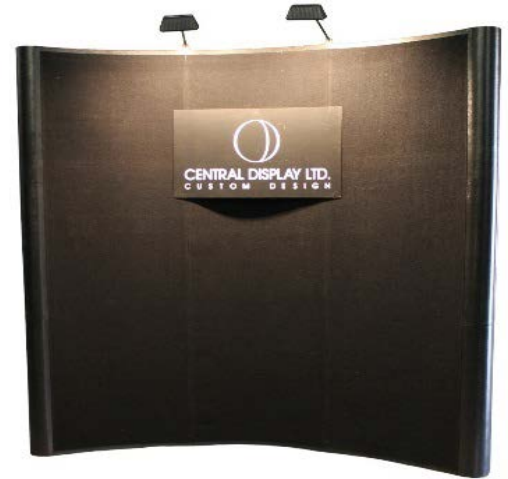
Pop-up Display - 10' wide x 8' tall