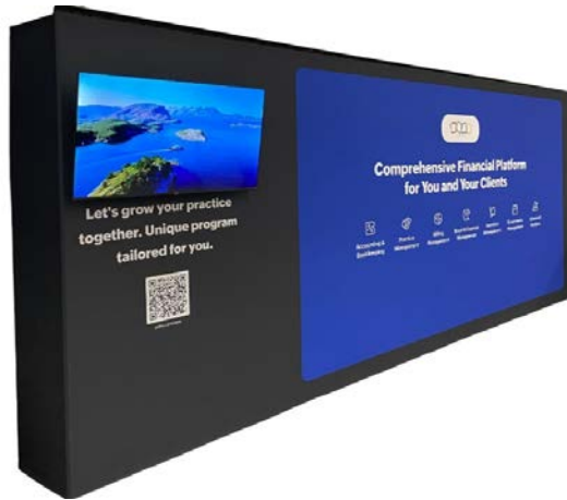
6 meters - Fabric Wrap Display TV options available - as shown exhibitor keeps fabric graphics