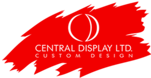
EXHIBIT INSTALLATION SERVICES