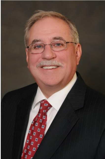
Tom Fitzgerald Family Services