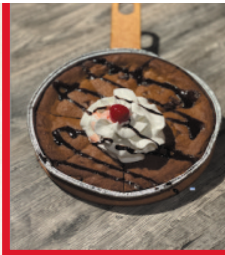
COLOSSAL COOKIE $8.25