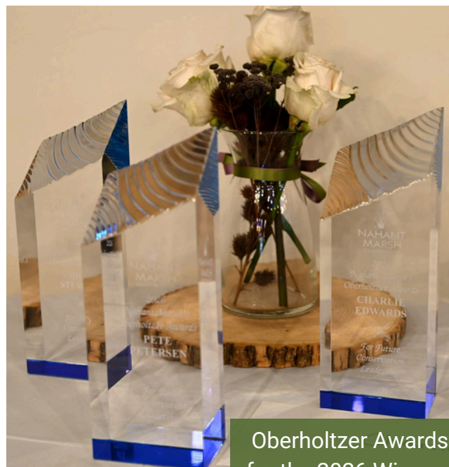
Oberholtzer Awards for the 2026 Winners

Nahant Marsh Board of Directors, donors, volunteers, staff, and community members came together to help raise over $100,000 for Nahant's mission and our hearts could not be more full.