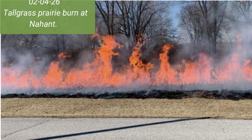
02-04-26 Tallgrass prairie burn at Nahant.

The weather cooperated and we were able to do prescribed burns on 2.65 acres of prairie on February 4th, 2026. This allowed us to go back through and more easily remove any trees and unwanted shrubs growing in these areas. The woodland adjacent to these prairies was overgrown with invasive mulberry trees and many dogwoods, so natural resources staff have been clearing out these species to allow for more sunlight to reach some smaller oak trees.