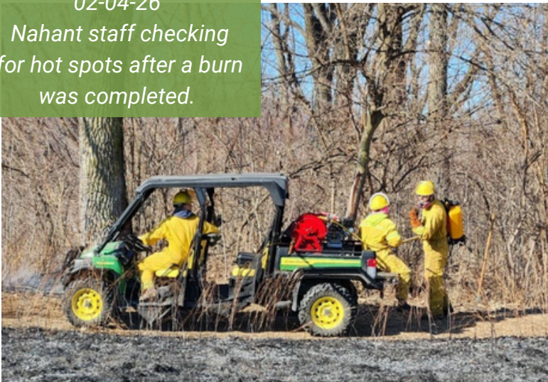
02-04-26 Nahant staff checking for hot spots after a burn was completed.

We spread extra prairie seed in our burned prairies and plan to plant a few additional native trees in the woodlands after the prep work is complete. A combination of prescribed fire, invasive species removal, and overseeding with forbs will help us to increase biodiversity and have higher quality habitat in these areas. We are looking forward to enjoying the spring wildflowers at Nahant in the coming months!