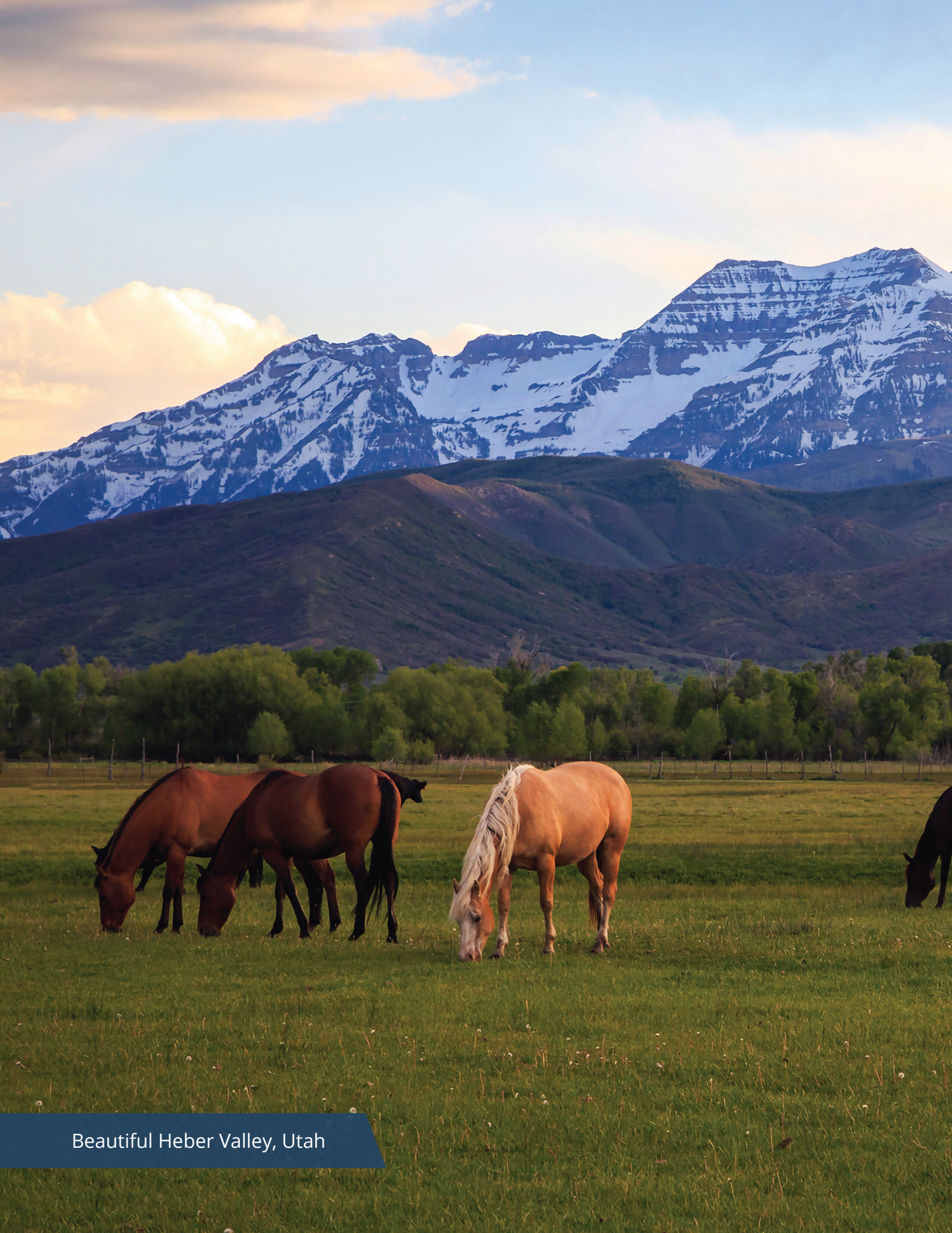
Beautiful Heber Valley, Utah