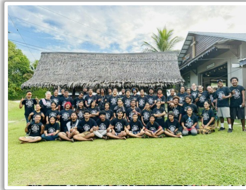
Identity in Christ Teen Camp 2025

In July the ministry team along with a great group of helpers from the church rallied together to share Christ with children and teens. VBS was July 14-18 and they chose a Super heroes theme challenging the kids that God can use anyone who has a surrendered heart. The kids enjoyed their Faith Force shirts, and we pray that many of these children will take a stand and be heroes for Jesus. The teens enjoyed their week of teen camp July 28-August 1 with the timely topic of finding their identity in Christ. The ministry team was excited that many teens gave their lives to Christ during this week. They enjoyed their new t-shirts as well!