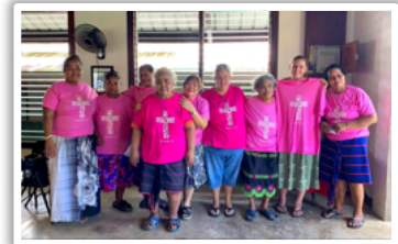
Mother's Day Shirts