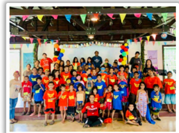
Faith Force VBS 2025