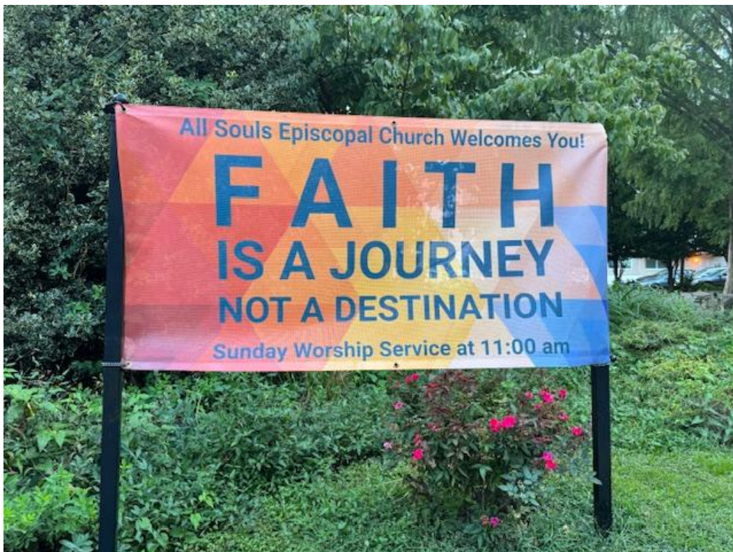
above, our sign that has been appreciated by people walking by, 8.28.25

Submit your All Souls photos to office@allsoulsdc.org to be featured as the All Souls picture(s) of the week