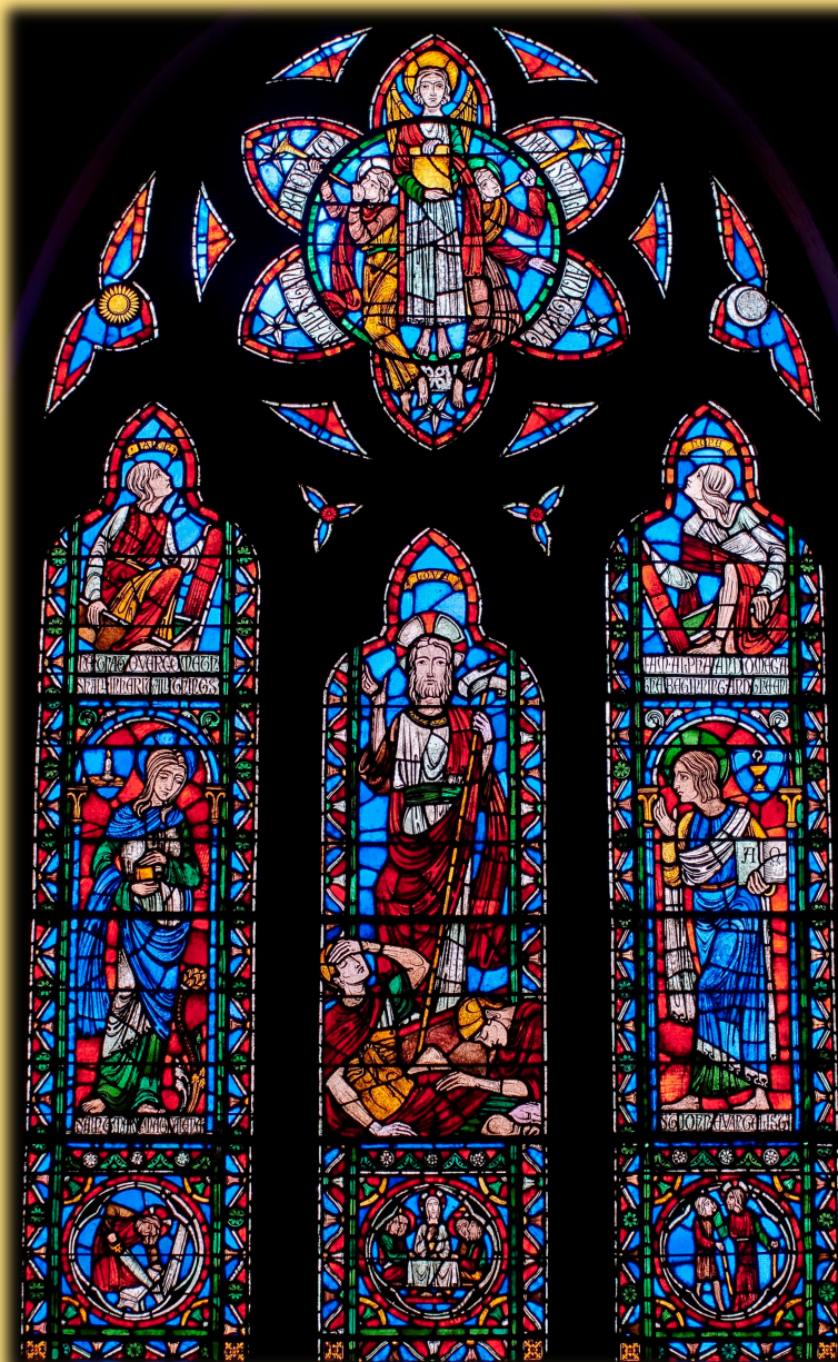
THE RESURRECTION WINDOW , center window behind baptismal font.