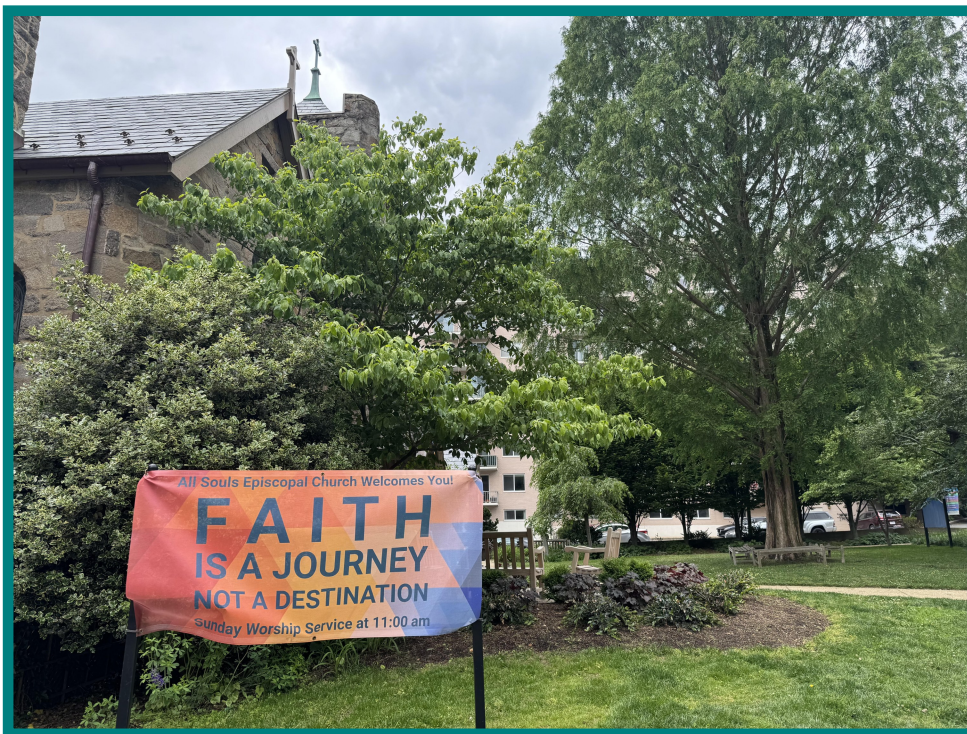
(above) The 2025-2026 All Souls Welcome Banner on the corner of Woodley Place and Cathedral Avenue near the new Sterrett Garden.