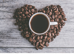
COFFEE HOUR & FELLOWSHIP