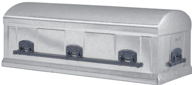
12ga Clark Galvanized Steel Vault