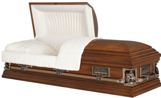
Pieta Poplar - Walnut Polished Finish Rosetan Crepe Interior - $5,295