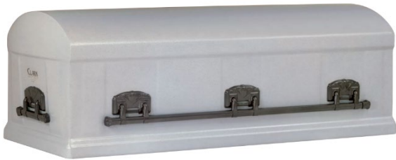
12ga Clark Steel Standard Vault (Coppertone, Silvertone, or White)