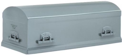
12ga Clark Steel Econovault