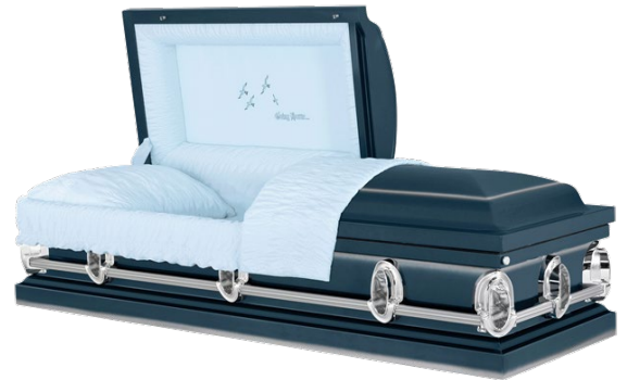
Homecoming - 20ga. Steel Polished Blue Blue Crepe Interior - $3,595