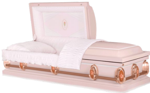
Misty Pink - 20ga. Steel Polished Pastel Pink/White Finish Pink Rose Crepe Interior, Pearls surround rose in panel - $3,595