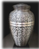
The Grove – Brass Urn - $195