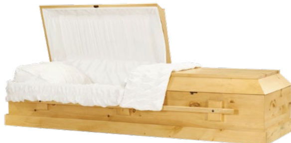
Frontier Pine – Flat Top Light Satin Interior - $3,295