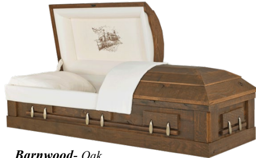
Barnwood - Oak Satin Timber Finish Natural Cotton Interior- $4,795