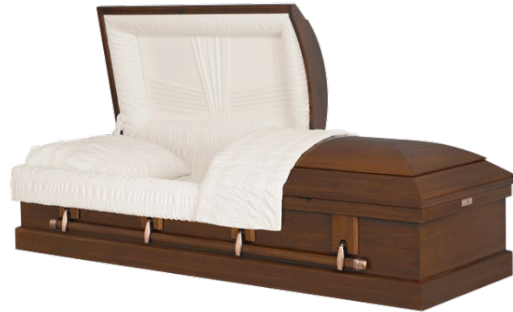
Whitmire II – Poplar Veneer Satin Dark Walnut Finish Rosetan Crepe Interior - $3,495