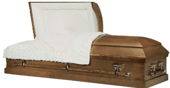
Prince – Poplar Veneer Light Satin Finish Rosetan Crepe Interior - $3,195