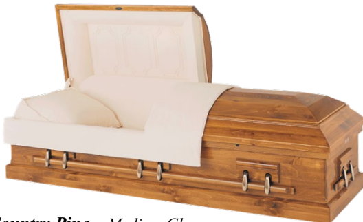
Country Pine – Medium Gloss Country Pine Finish Tailored Cotton Interior - $5,095