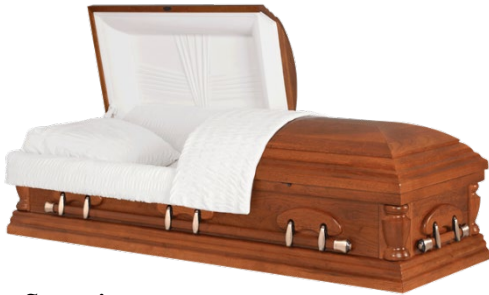
Sovereign - Pecan Satin Finish Ivory Majestic Velvet- $5,795