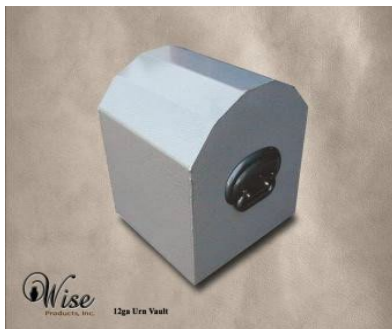
12ga Wise Urn Vault - $400