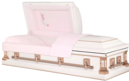
Sterling - 18ga. Steel Antique White Silver Rose / Ebony Platinum Pink Crepe / Silver Crepe Interior - $3,895