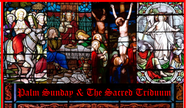
Palm Sunday & The Sacred Triduum

Almighty ever-living God, who as an example of humility for the human race to follow caused our Saviour to take flesh and submit to the Cross, graciously grant that we may heed his lesson of patient suffering and so merit a share in his Resurrection. Who lives and reigns with you in the unity of the Holy Spirit, one God, for ever and ever. Amen.