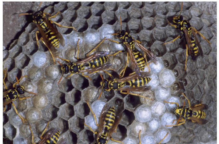
European paper wasp ( Polistes Diminulus )

European Paper Wasps (Dominulus) have recently become very common in Indiana. These paper wasps often build nests inside enclosed voids of lighting fixtures, bird boxes, gas grills, motor homes, boats and other infrequently used spaces. This often creates unexpected encounters with people and has led to an increase in stings to people. Colony destruction is best accomplished with any number of pressurized products containing quick knockdown materials such as resmethrin and synergized pyrethrins (Wasp Freeze®, Wasp Stopper®, Bee Bopper®, etc.). Stand well away from the colony and completely soak the nest material. Remember that paper wasps are highly beneficial caterpillar predators and relatively nonaggressive. Therefore, avoid controlling them unless colonies present a direct stinging threat.