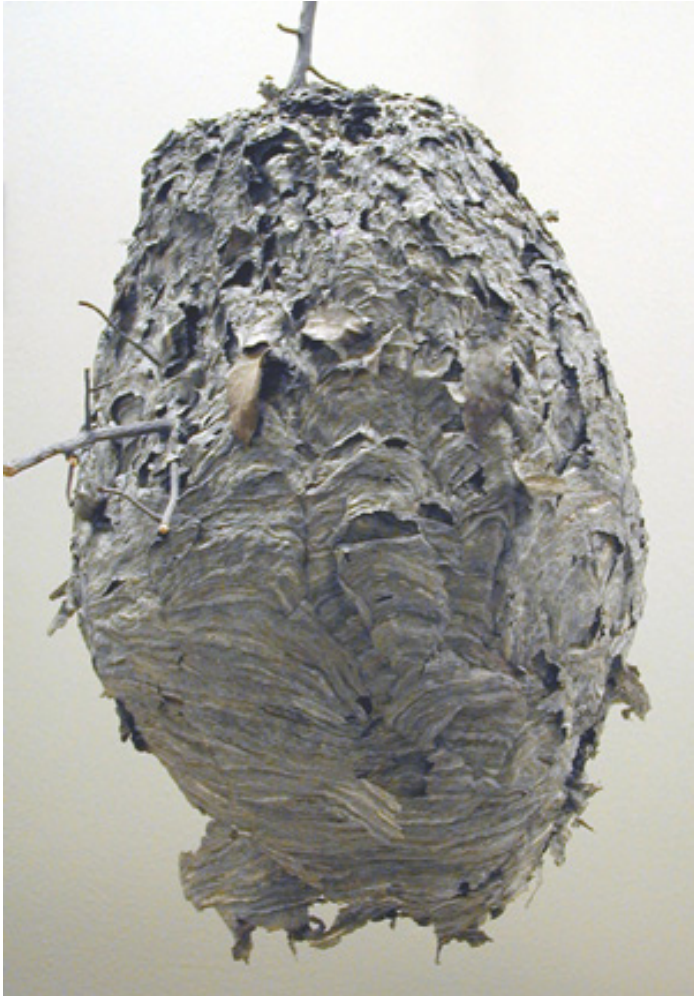
Nest of the baldfaced hornet

Sprays should be directed into the nest entrance (typically located near the bottom of the nest), and the entire nest should be thoroughly soaked. Many pressurized products for home insect control are not effective. Look for products with synergized pyrethrins plus petroleum distillates (e.g., Wasp Freeze®) which freezes the wasps upon contact. Colonies situated high in trees far from human activity should be left alone.