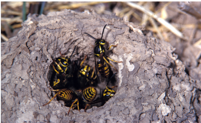
Yellowjacket ground nest

Paper Wasps: These slender, long-legged wasps exist in small colonies associated with a single, exposed nest comb that typically is suspended from eaves or in outbuildings.