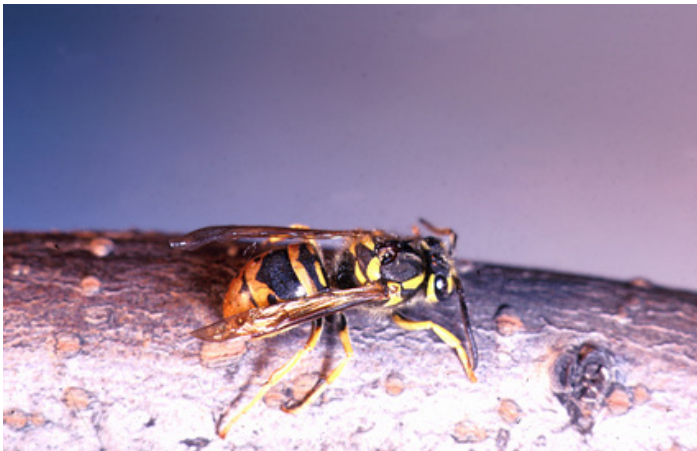
Adult worker yellowjacket

Control should follow the same rules as with honey bees: control at night and wear adequate protective clothing with veil and gloves. A flashlight covered with red cellophane should be used when applying insecticide at night. Although small, early season colonies and most underground colonies are easily controlled, above-ground and nearly all structural colonies are best handled by professional pest control operators unless the person attempting control is knowledgeable about social wasps.