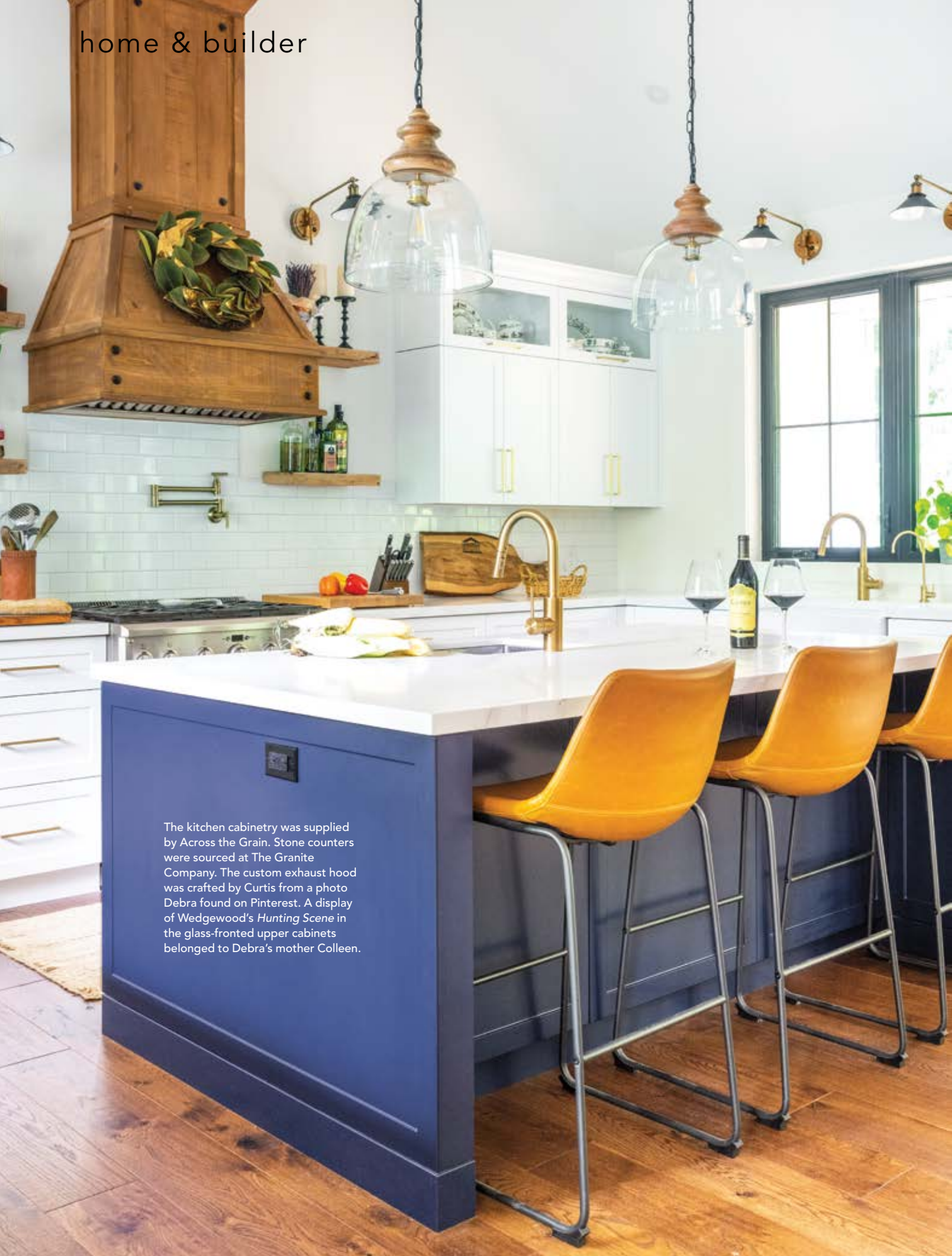
The kitchen cabinetry was supplied by Across the Grain. Stone counters were sourced at The Granite Company. The custom exhaust hood was crafted by Curtis from a photo Debra found on Pinterest. A display of Wedgewood's Hunting Scene in the glass-fronted upper cabinets belonged to Debra's mother Colleen.