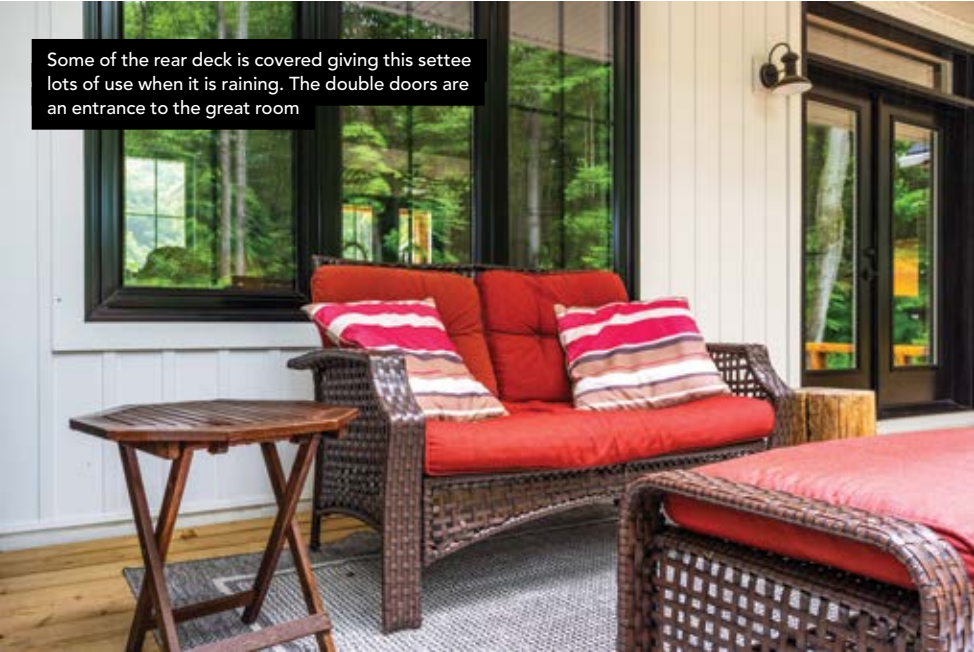
Some of the rear deck is covered giving this settee lots of use when it is raining. The double doors are an entrance to the great room