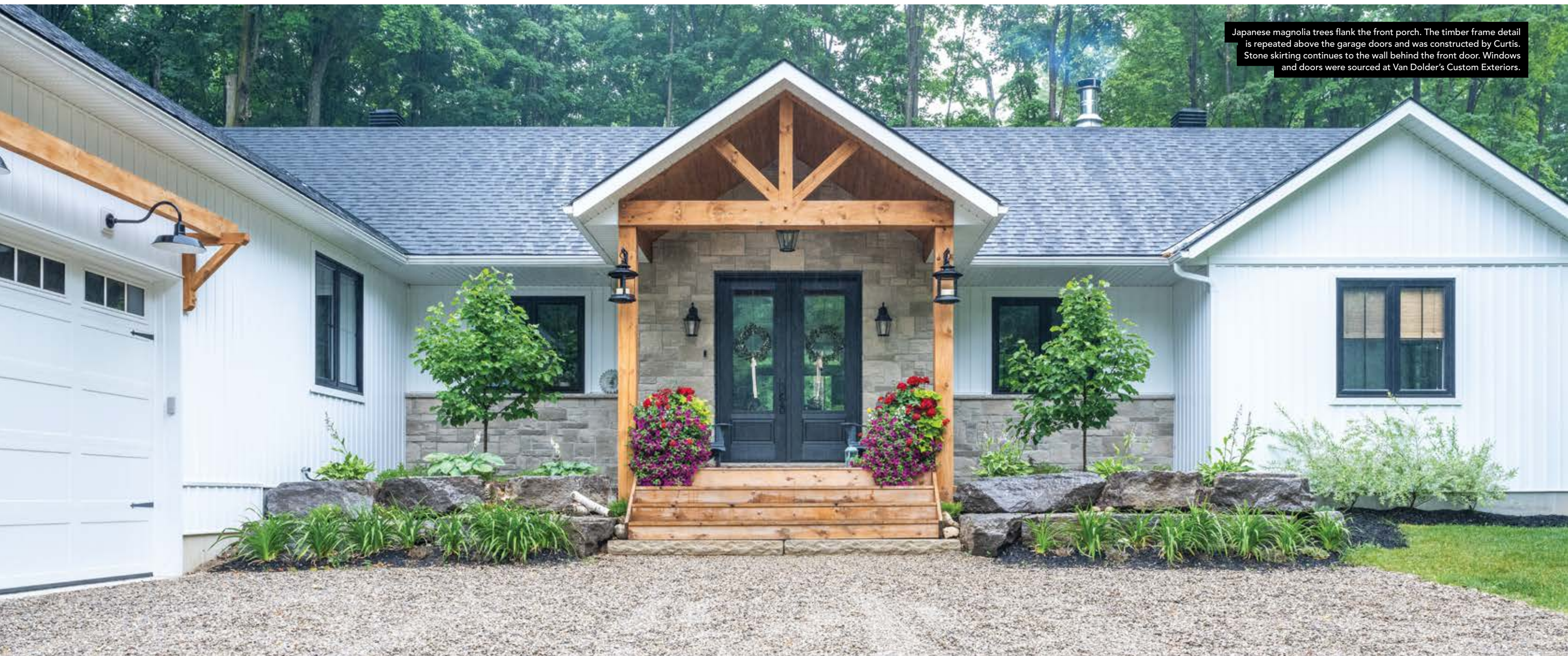
Japanese magnolia trees flank the front porch. The timber frame detail is repeated above the garage doors and was constructed by Curtis. Stone skirting continues to the wall behind the front door. Windows and doors were sourced at Van Dolder's Custom Exteriors.