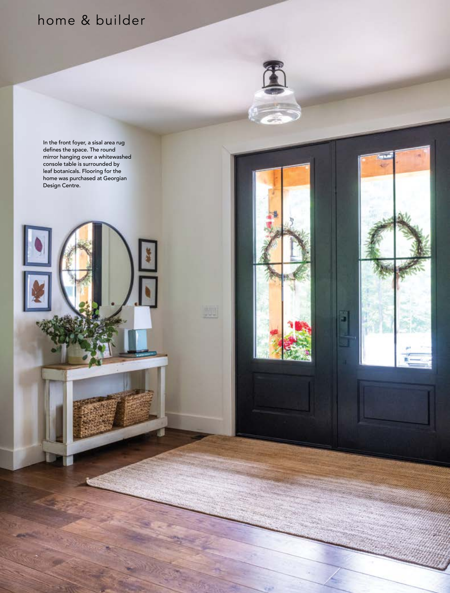
In the front foyer, a sisal area rug defines the space. The round mirror hanging over a whitewashed console table is surrounded by leaf botanicals. Flooring for the home was purchased at Georgian Design Centre.