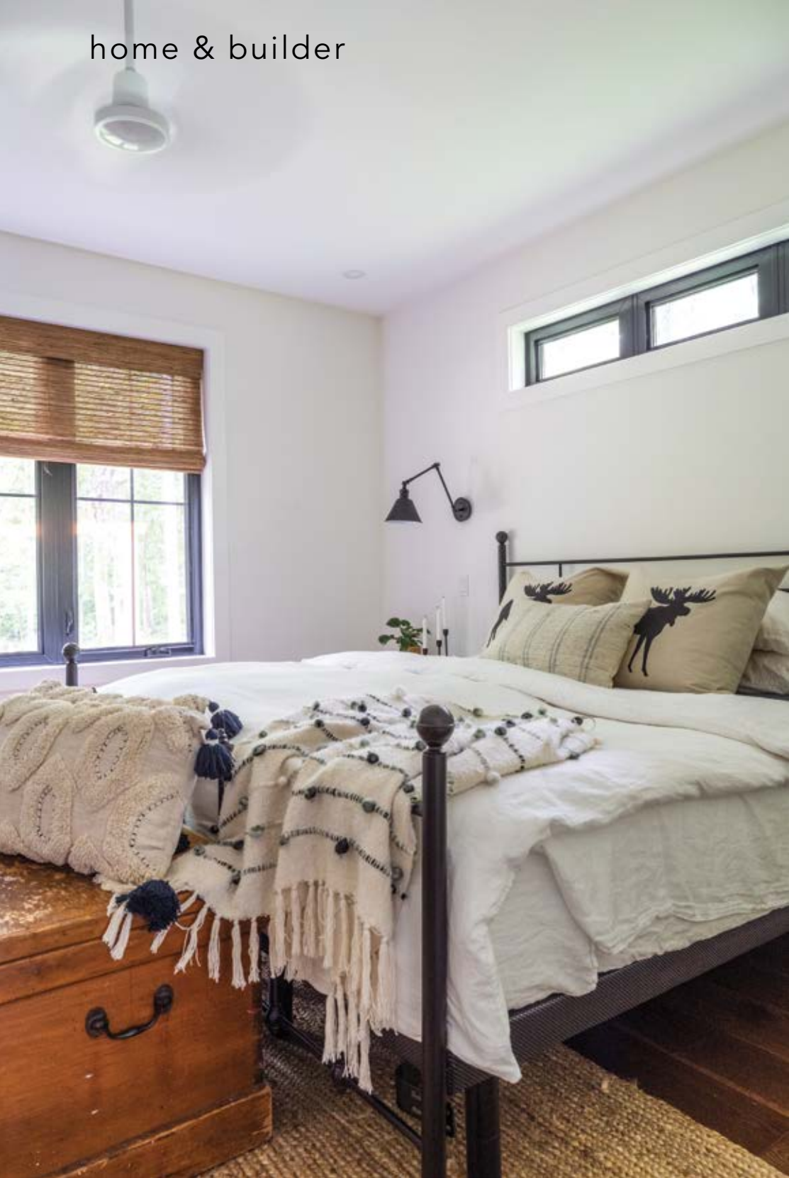
In the primary bedroom, white linen bedding is enhanced with texture and black details. Bedside sconces have adjustable arms so the light can be moved closer to the bed. Painting for the home was completed by Rick Dodd Custom Painting Inc. BELOW: This is the view of the en suite from the primary bedroom. The sliding Z-style barn door opens to the walk-in closet.