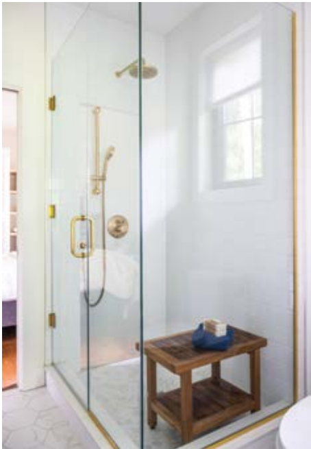
ABOVE: Hexagon tile on the floor of the shared bathroom continues up two sides of the shower. The teak bench can be used to hold soap and shampoo or be used as a seat when relaxing under the rain showerhead. BELOW: Olivia's bedroom is painted blush pink. The floating shelf above the bed displays mementos and the open shelving by the closet stores extra towels and linens.