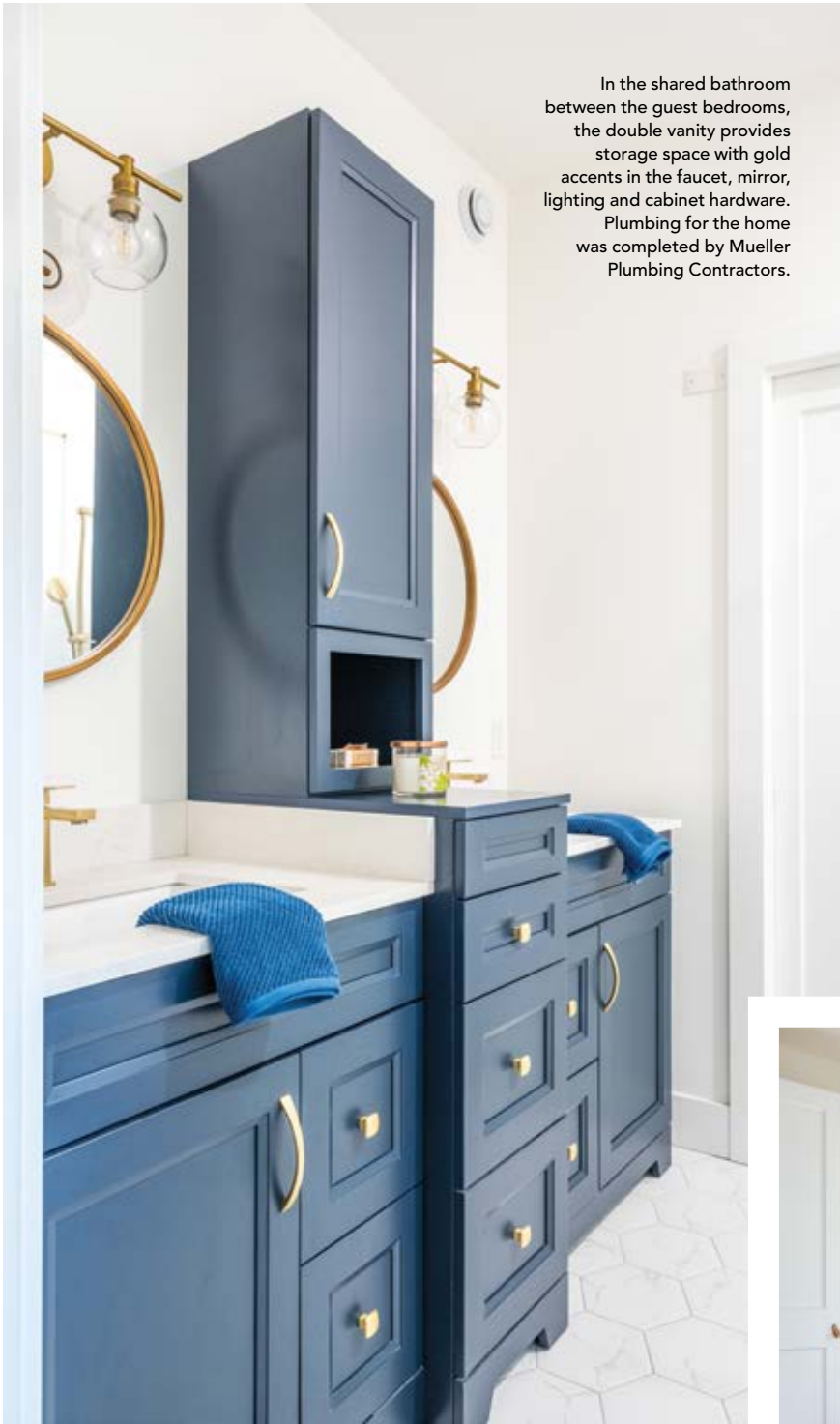
In the shared bathroom between the guest bedrooms, the double vanity provides storage space with gold accents in the faucet, mirror, lighting and cabinet hardware. Plumbing for the home was completed by Mueller Plumbing Contractors.