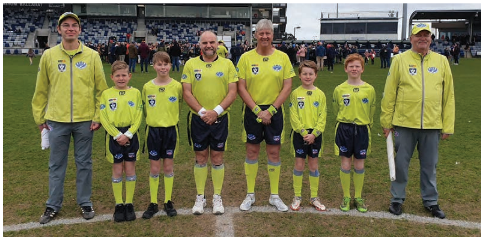
BFNL Under 13 Reserves