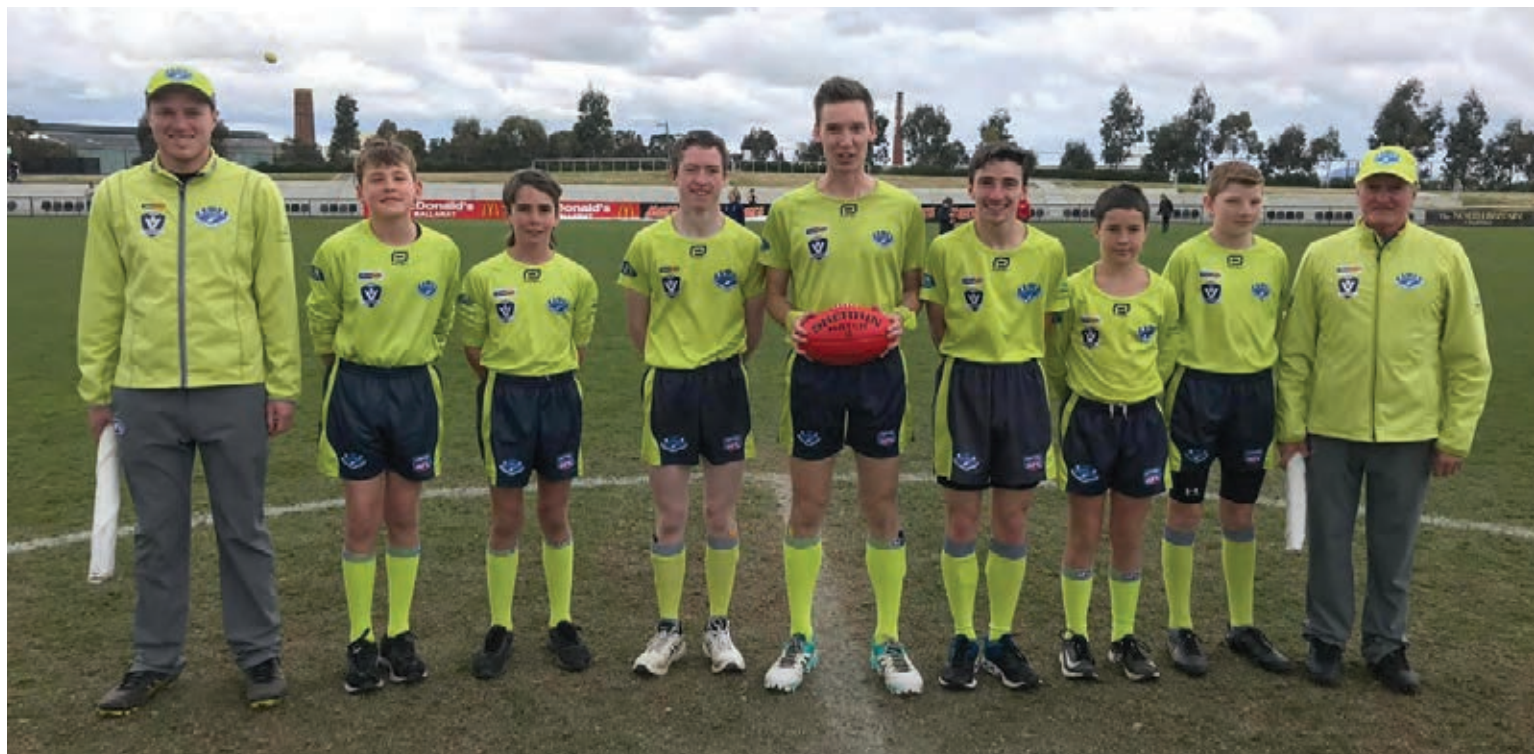
BFNL Under 15 Seniors