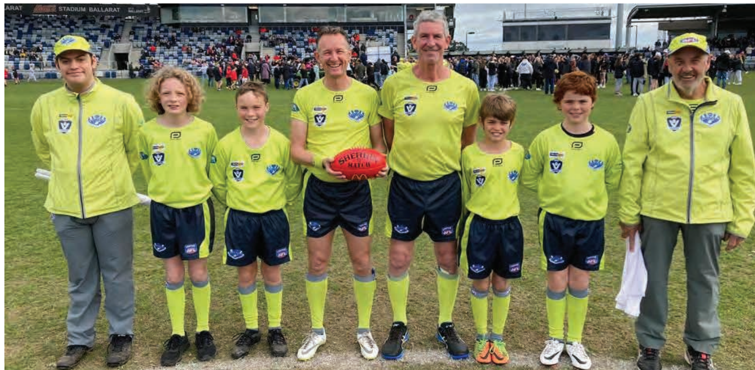
BFNL Under 13 Seniors