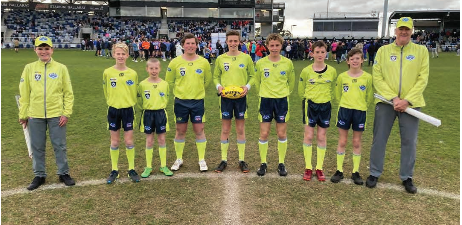
BFNL Under 17 Seniors