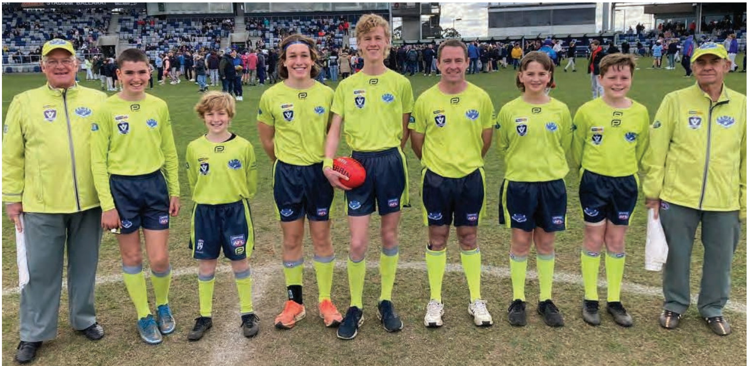
BFNL Under 17 Reserves