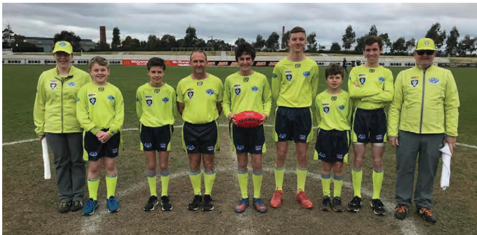
BFNL Under 15 Reserves