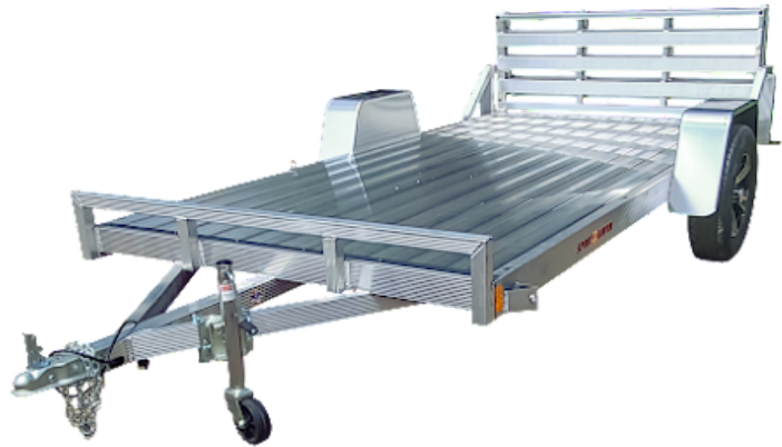
Image for representation only. Options and features may differ.