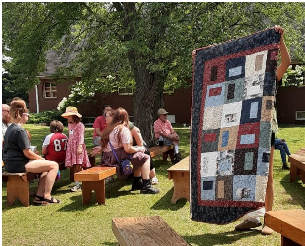
Photo of our donated quilt at the Luther Point Bible Camp live auction