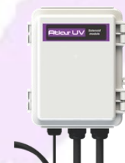
Solenoid Connection Module