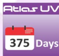
Lamp life remaining