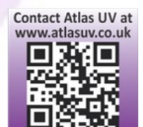
QR code screen