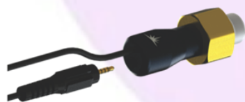
UV Sensor Module