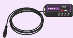
4-20 mA Module (used with UV sensor)