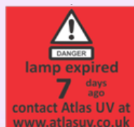
Lamp change warning