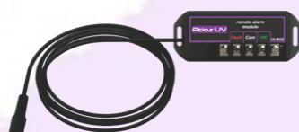
Volt Free Contact Module