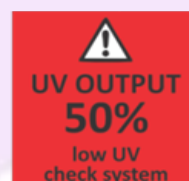
Low UV warning screen