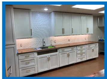
Fellowship Hall Kitchen, Heritage Baptist