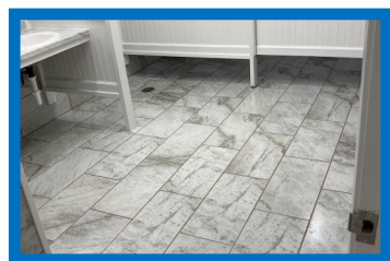
Men's Bathroom, Galilean Baptist