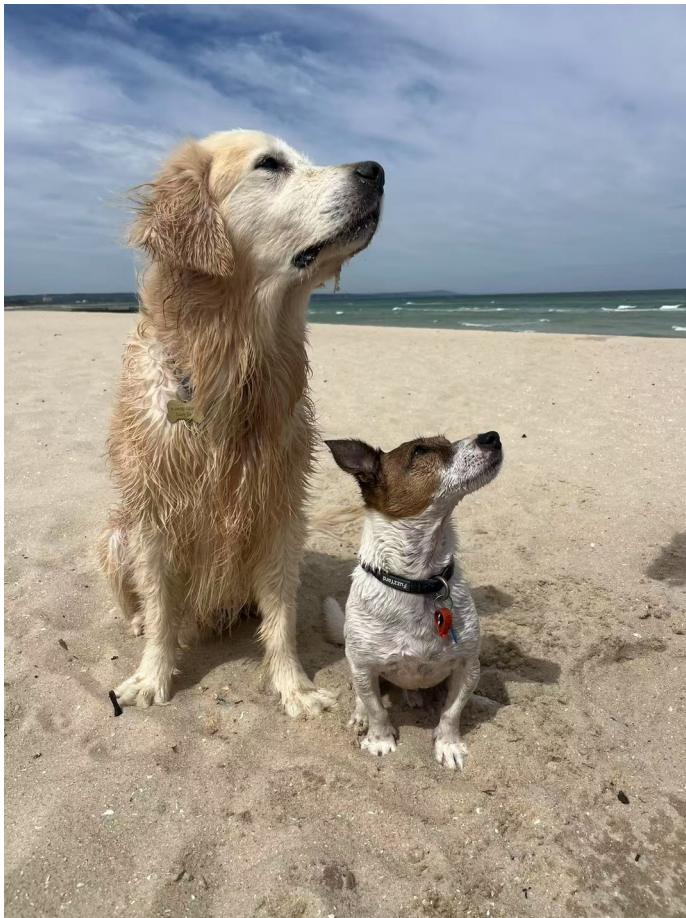
Turbo (left) and Hunter

Pets Corner is a chance to connect and share a part of your life with the rest of the Beyond 50 community. If you like to share a photo of your furry friend, please feel free to email it to beyond50@monash.edu