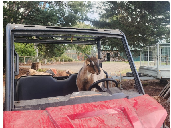
Lollipop the goat