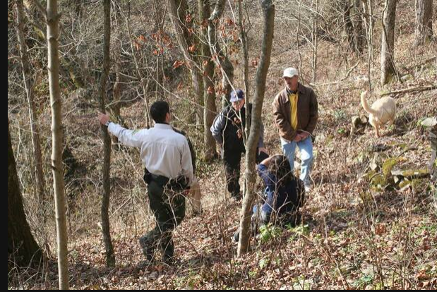
Trail of Tears Fieldwork in Montgomery County in 2012.