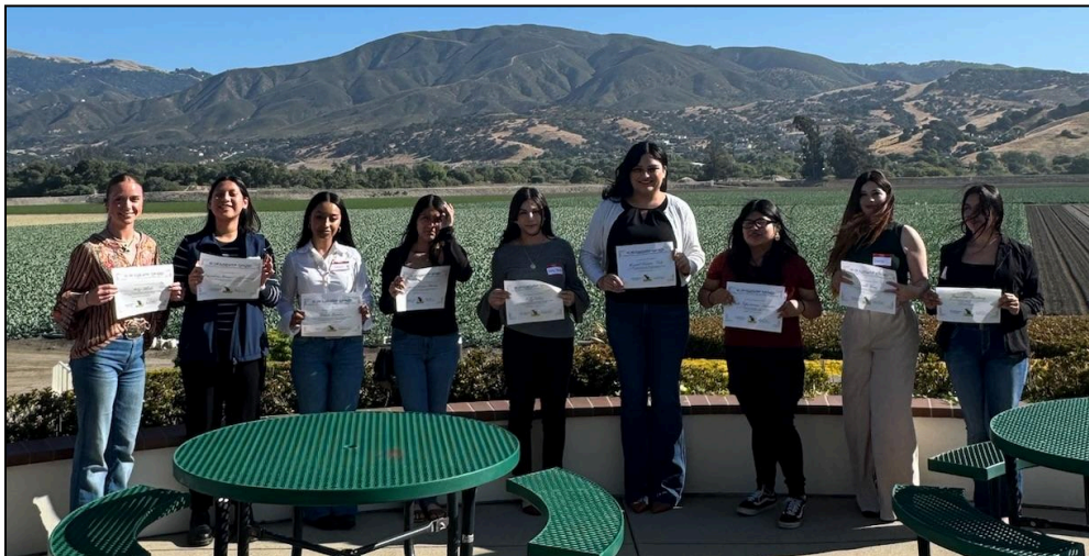
Nine Scholarship Recipients proudly displaying their Certificates of Recognition at our Annual Scholarship Reception from June 13, 2025.

To all our partners, supporters, and community members — thank you for continuing to champion our mission. Let's carry the momentum of June forward, grounded in purpose and looking ahead with optimism.