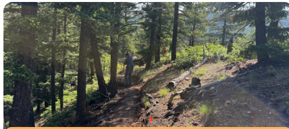
Volunteers working on a Mace Trail re-route